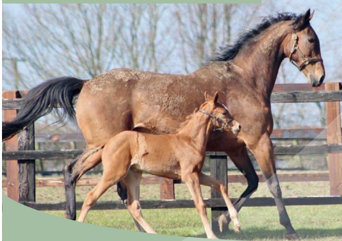
Terre du Vent with filly foal by Australia

There are two potential brood mares who are still racing. Darling Du Large and Zartoise will become brood mares when they retire from racing.